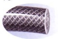
ClearGard® CBT Series PVC Tubing pg 30