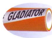
SaniGard® Gladiator® Crush-Resistant Hose pg 27