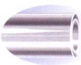
ClearGard® CCT Series PVC Tubing pg 30