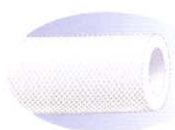
PureGard® FPD (4-ply, polyester braid) pg 24