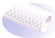
PureGard® SPD (single ply, polyester braid) pg 24