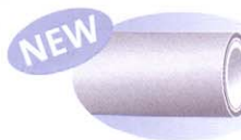
SaniGard® G-FDA Gray FDA Sanitary Transfer Hose pg 28