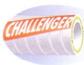
SaniGard® Challenger™ FEP/Teflon® Suction & Discharge Hose pg 27