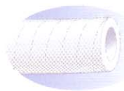
PureGard® FPW (4-ply, polyester braid with stainless steel helix wire) pg 25