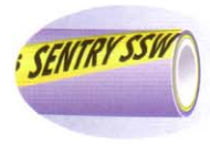
SaniGard® Sentry® SSW Softwall Discharge Hose pg 26