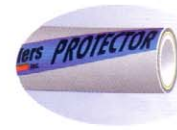
SaniGard® Protector™ PSD Suction & Discharge Hose pg 26