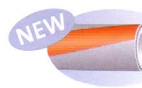
SaniGard® FGR Sanitary Transfer Hose pg 28